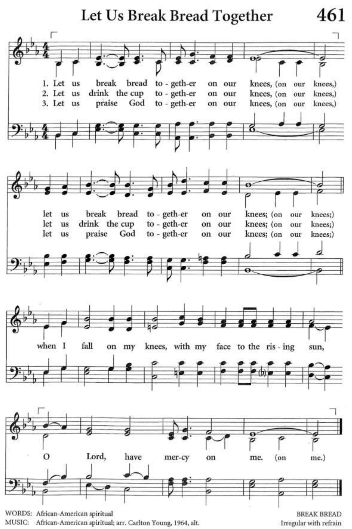
Arr. © 1965 Abingdon Press (Admin. by The Copyright Company)