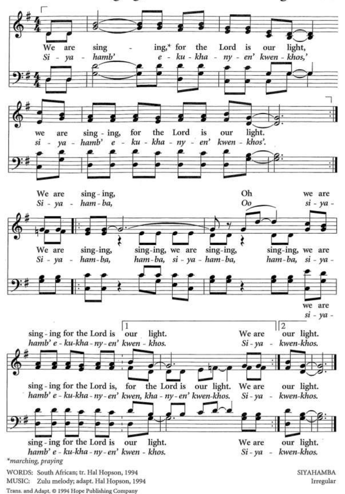
We Are Singing, for the Lord Is Our Light 155