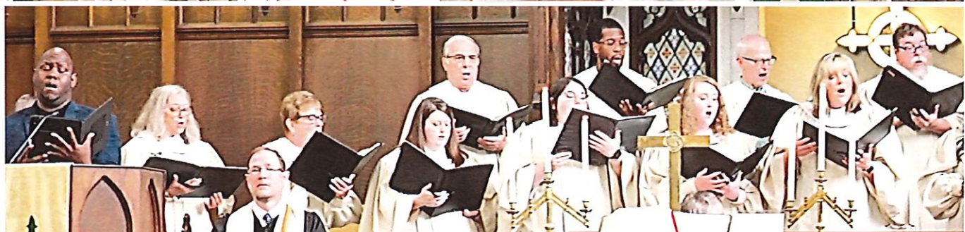
The First Baptist Church Chancel Choir