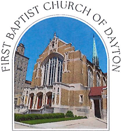
Bicentennial Celebration 1824 - 2024